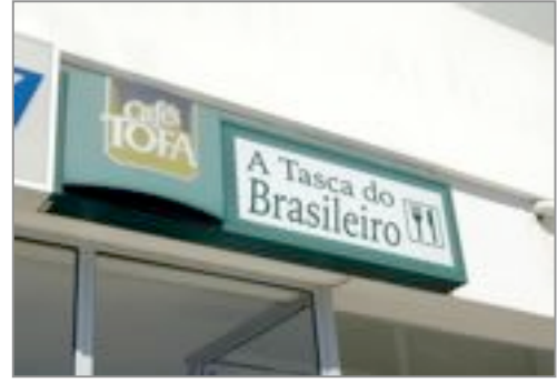
A Tasca do Brasileiro Tel: 262 769 014

On the beachfront there are various restaurants and beach bars all serving fresh fish and seafood. Prainha with the surfboard sign is a surfer bar with a restaurant attached, they also do cocktails, and it has great views of the surfers. O Pescador specialises in fresh fish. Algamar has live music most nights and also does very good value lunches. It's closed on Wednesday. Danau Bar is open late and at weekends has Portuguese karaoke, and there is Bar do Praia , a small beach bar. Further along the beach, about 100kms in the direction of Peniche is BB Bar run by Baleal Surf Camp. They have recently started doing meals but traditionally it is a beach bar open until the early hours at weekends.