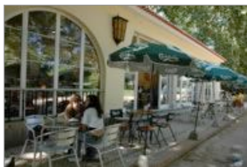
The café in the Park