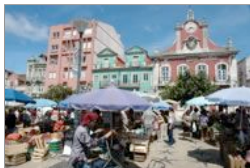
Praça de Frutta