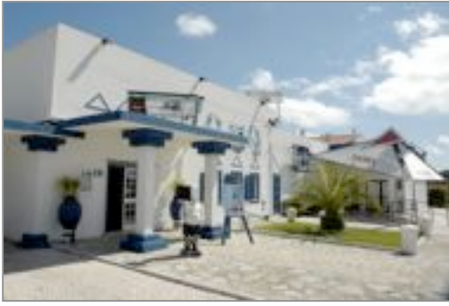
Voila Restaurante and Grill Tel: 262 188 162