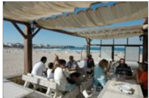
On the terrace at O Pescador

From Baleal head into Peniche or retrace your steps back towards Ferrel turning sharp left in the village 'Casais do Mestre Mendo'. Continue along this road until you see the left turning for Praia D'El Rey.