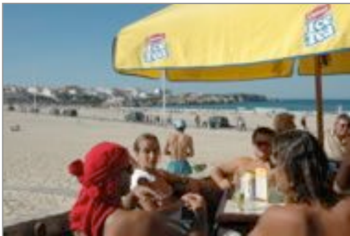
On the terrace at Algamar

On the beachfront there are various restaurants and beach bars all serving fresh fish and seafood. Prainha with the surfboard sign is a surfer bar with a restaurant attached, they also do cocktails, and it has great views of the surfers. O Pescador specialises in fresh fish. Algamar has live music most nights and also does very good value lunches. It's closed on Wednesday. Danau Bar is open late and at weekends has Portuguese karaoke, and there is Bar do Praia , a small beach bar. Further along the beach, about 100kms in the direction of Peniche is BB Bar run by Baleal Surf Camp. They have recently started doing meals but traditionally it is a beach bar open until the early hours at weekends.